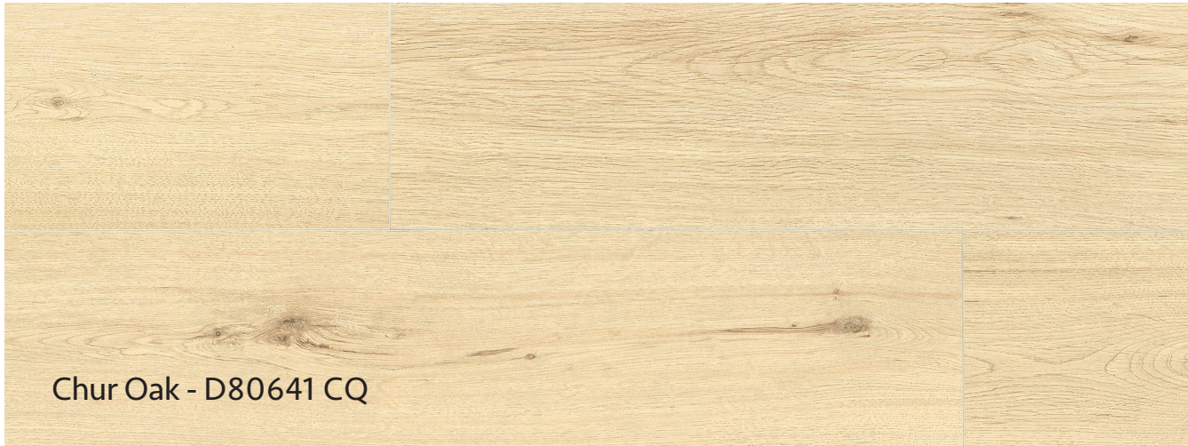
Chur Oak - D80641 CQ