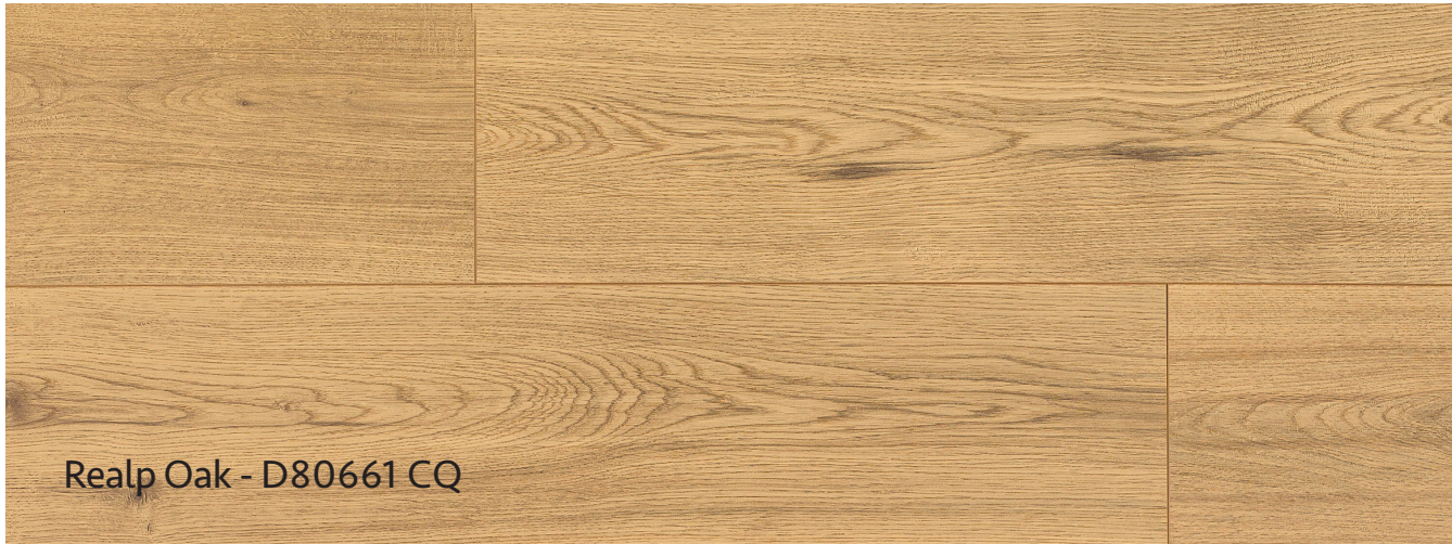
Realp Oak - D80661 CQ