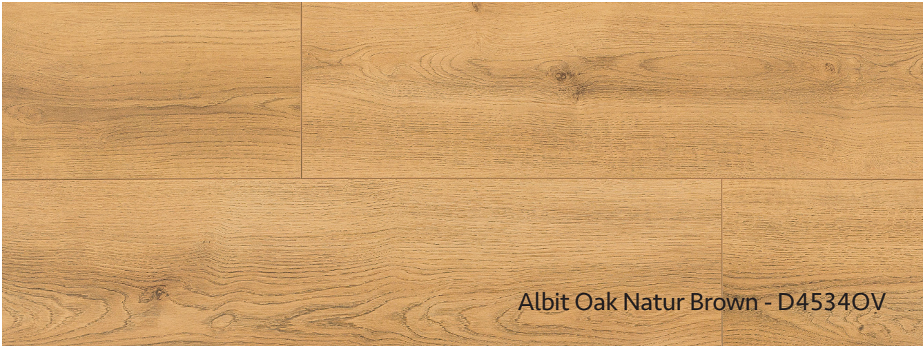
Albit Oak Natur Brown - D4534OV