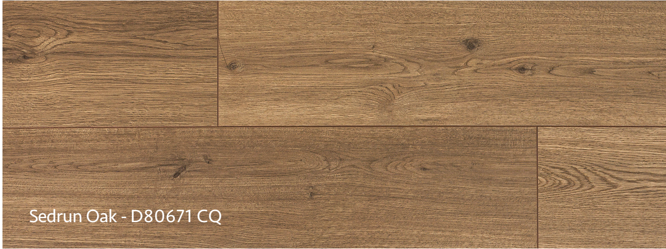
Sedrun Oak - D80671 CQ