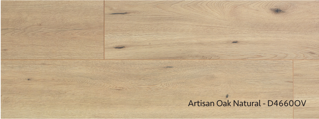
Artisan Oak Natural - D4660OV