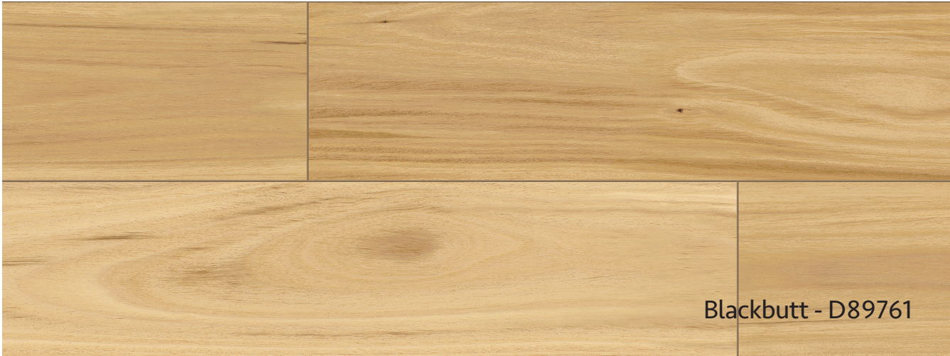
Blackbutt - D89761