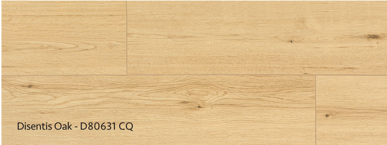
Disentis Oak - D80631 CQ